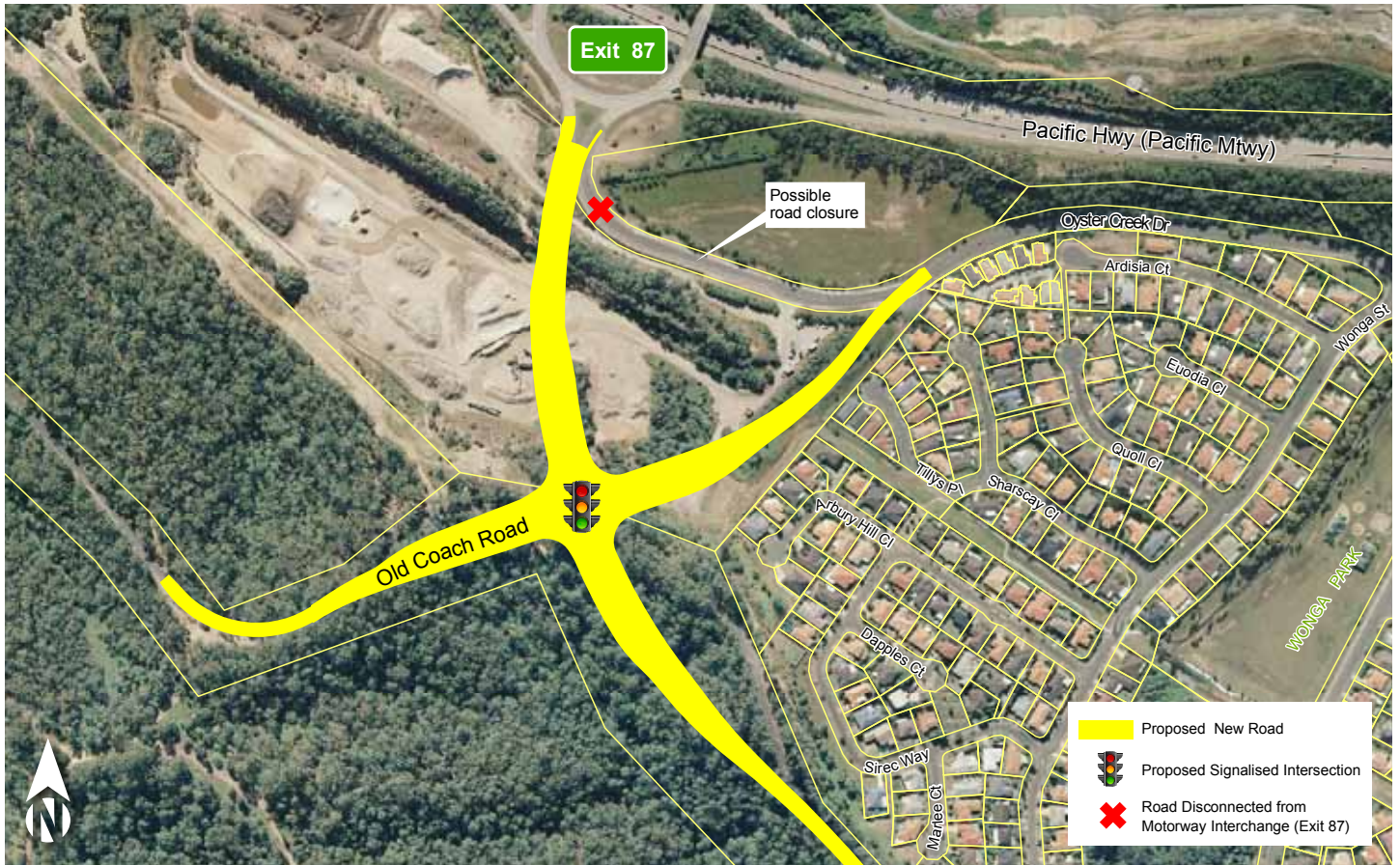
Old Coach Road Connector proposal